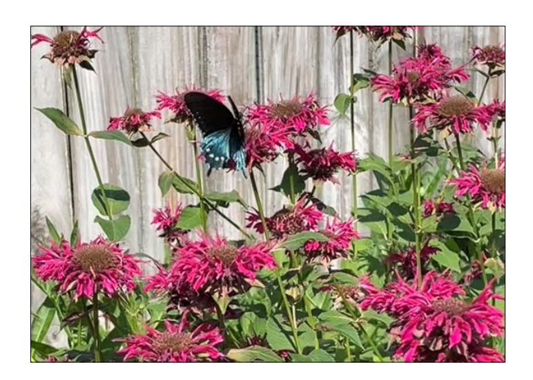
Magenta with butterfly is bee balm