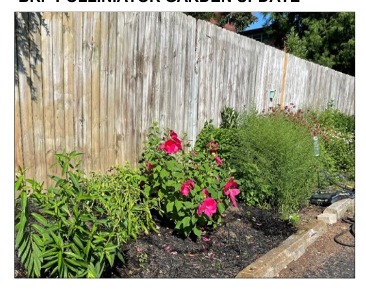
Large flowering bush in the longer garden is Hibiscus