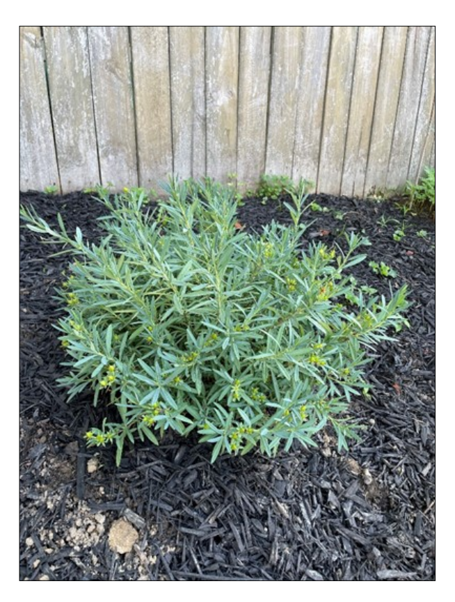
St. John's Wort, a new bee attractor