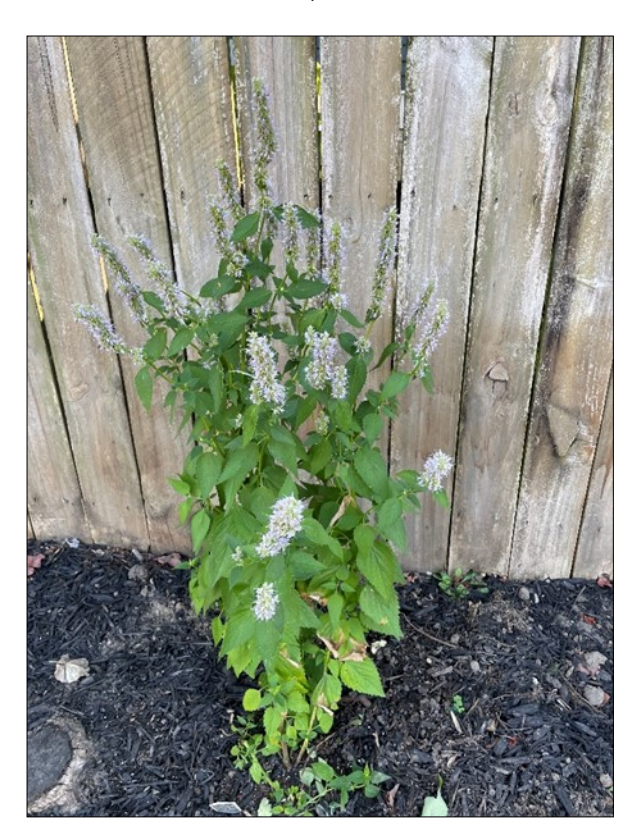
Blue Hyssop, a new bee attractor