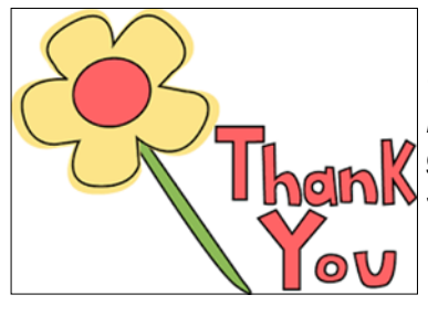
Thank you to the BRP watering crew who help to keep the garden alive in the summer heat.