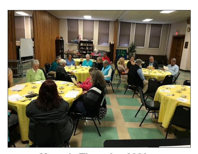
Maundy Thursday 2023