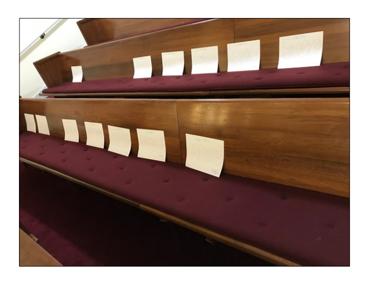
The names of our Youth In the pews