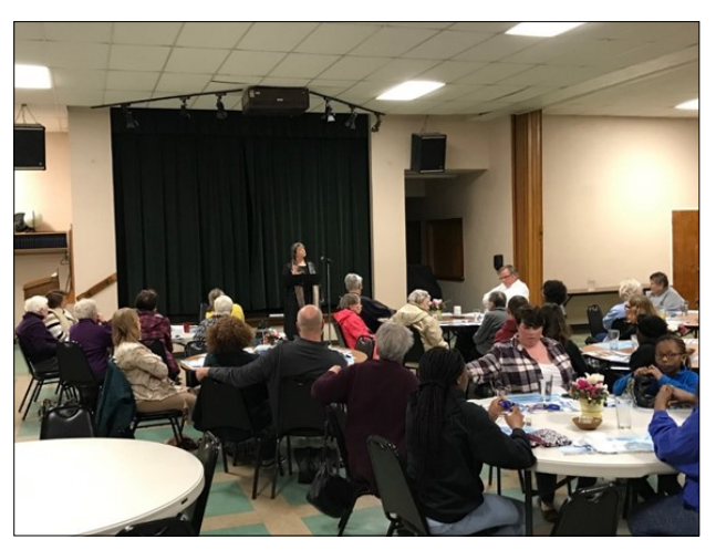
Lenten Dinner 1