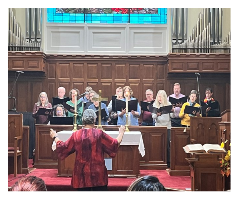
A festive Reformation Sunday at BRPres with guest musicians!