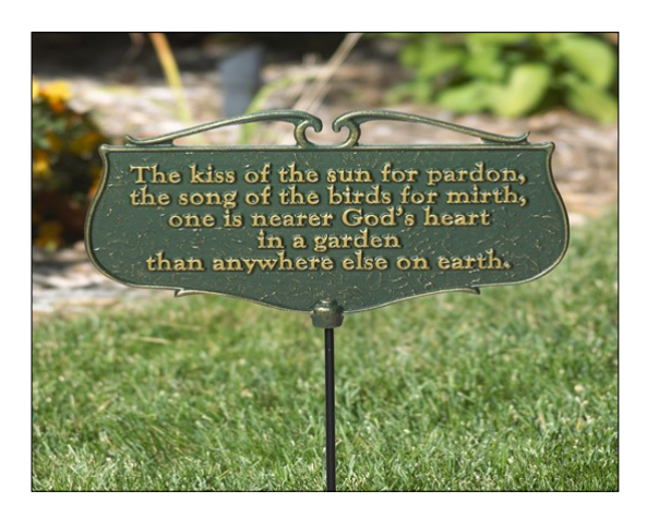
BRP Newsletter Page 5