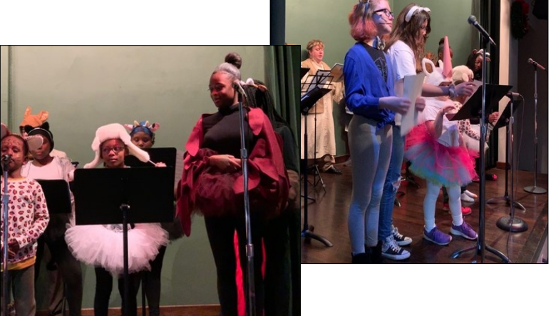
Youth practicing for Cantata "Unfriendly Beasts"