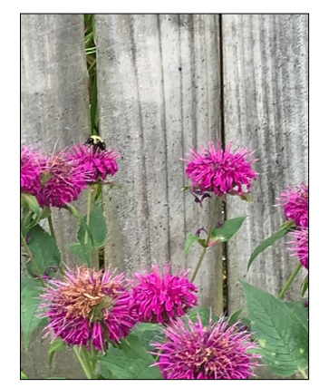
Although this is a bumblebee and not a honeybee, bees and wasps of all kinds assist in the process of keeping our earth pollinated.

Many different kinds of bees and wasps take to the flowers in our garden.