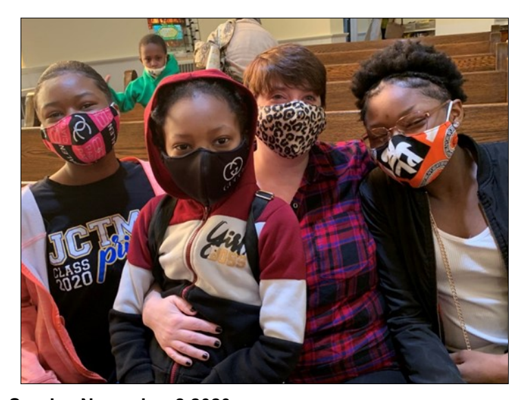
Sunday November 8 2020